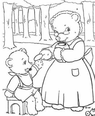
"Thank you, grandma."